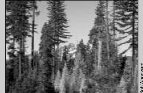
Future Metolius Preserve