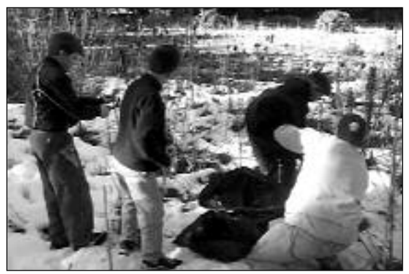
Campfire kids, lead by Forest Service volunteers, in the battle against teasal at Camp Polk Meadow Preserve.