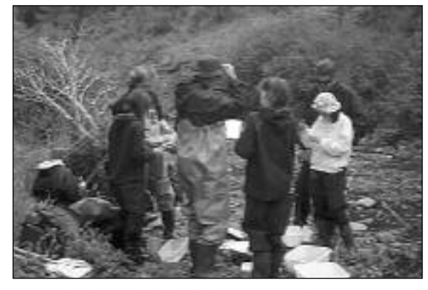
Local students, with the help of volunteer mentors, study Squaw Creek.

• Launched the Back to Home Waters program with matching grant funds of $50,000 from the National Fish and Wildlife Foundation. This program seeks to identify, prioritize and restore the critical habitat to facilitate reintroduction of salmon and Steelhead trout to the Upper Deschutes Basin.