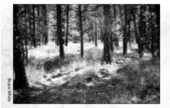
1996 Habitat and scenery preservation Deschutes County near Sisters - 63 acres