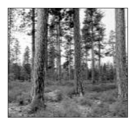
Wildlife preservation and public access <u>Jefferson County near Madras - 840 acres</u> ALDER SPRINGS